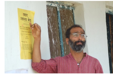
Health Mela 2008

We awarded this scholarship to 81 students on merit-cum-means basis. The methodology to grant these scholarships and the parameters thereof, were developed by a team of My Himachal members.